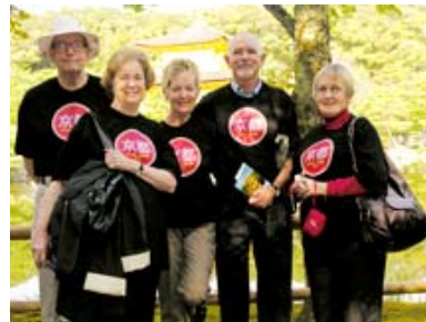
Kyoto Travellers, 2006